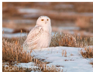
Open: © Betty Holling