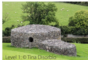
Level 1:

April Contest Theme: Black & White Open: Wildlife