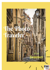
PHOTO TRAVEL DIVISION NEWSLETTER

You'll find that the Photo Travel Division newsletters contain a lot of useful information for all photographers, not just for those interested in travel photography.