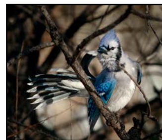
Feather Cleaning