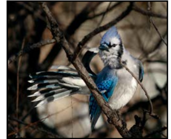
Feather Cleaning