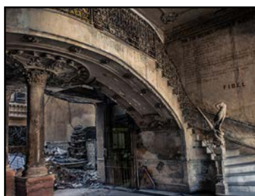
Unexpected Entrance © Lynne Lewis