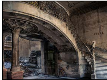
Unexpected Entrance © Lynne Lewis