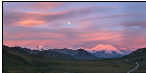
Alpen Glow on Denali