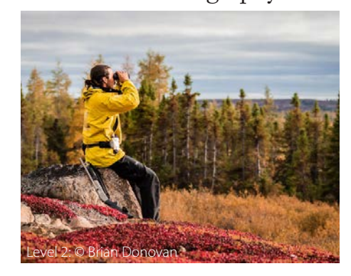
August Contest Theme: Filters Open: Landscapes

July Contest Winners "Adventure Photography"