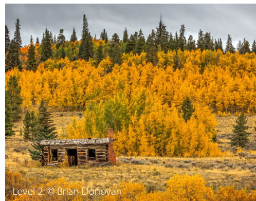
Level 2: © Brian Donovan

November Contest Theme: Lucky Shot! (Right Place, Right Time)